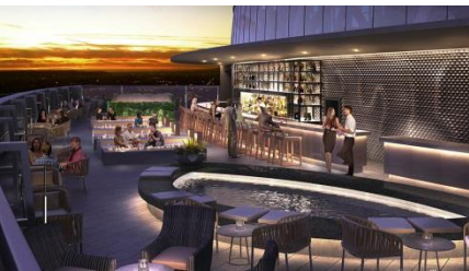
Sky Deck – 73 rd Floor