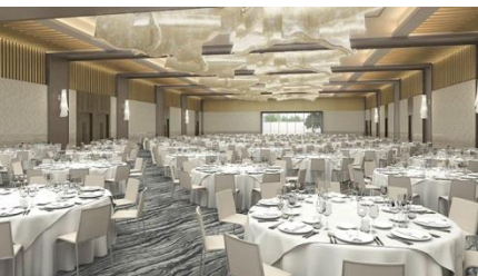
Wilshire Grand Ballroom