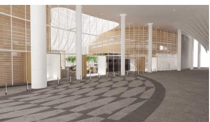
Auto-centric Porte Co-chère and 5 th Floor Access for Automotive Events